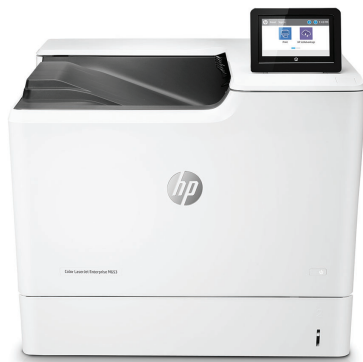
HP Color LaserJet Enterprise M653dn

This HP Color LaserJet Printer with JetIntelligence combines exceptional performance and energy efficiency with professional-quality documents right when you need them—all while protecting your network with the industry's deepest security. 1