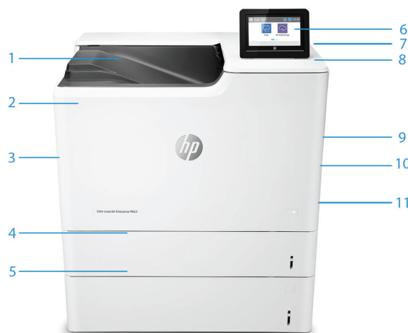
HP Color LaserJet Enterprise M653x