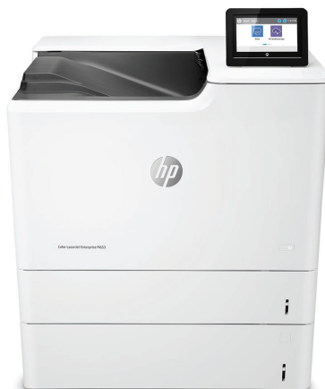
HP Color LaserJet Enterprise M653x