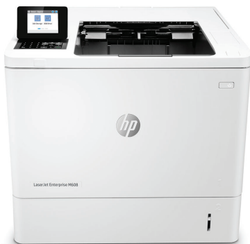
HP LaserJet Enterprise M608n

This HP LaserJet Printer with JetIntelligence combines exceptional performance and energy efficiency with professional-quality documents right when you need them—all while protecting your network from attacks with the industry's deepest security. 1