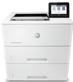
HP LaserJet Enterprise M507x