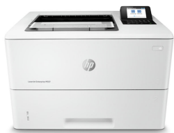
HP LaserJet Enterprise M507dn